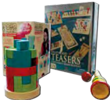
Games and puzzles help build skills.

Caregivers are encouraged to watch their loved ones through a large window that connects a comfortable waiting area to the five-zone wellness circuit. Each zone focuses on one of the five different aspects of healing: physical fitness, brain training, nutritional education, meditation, and yoga. Elliptical machines and exercise balls get blood flowing and increase energy. Brain games and 3D puzzles challenge the brain and promote learning.