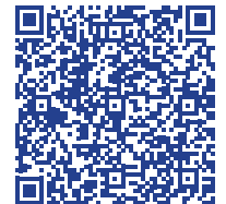
Scan QR code to listen to ‘Mike-at-the-Mic’

I also serve as staff liaison to the Council for the Head Injured Community (CHIC), which is one of the Alliance’s key advocacy committees. CHIC’s mission is to champion and publicize the advocacy, rights, and needs of people who have survived brain injury. CHIC also educates the brain injury community through its ‘Mike-at-the-Mike’ sessions, which engage members of the audience with a panel of experts to explore various topics related to living with brain injury. ‘Mike-at-the-Mic’ ( bit.ly/2tlksf7-MAM ) has been a popular feature of the Foundation’s TBI consumer conferences.