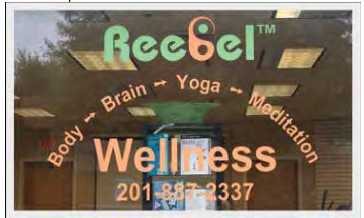
Reebel Wellness storefront in Waldwick, New Jersey

Through Reebel Wellness, she shares with others the tools that helped her heal on the difficult, and often lonely, road to recovery.